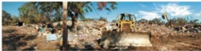
2004 Hurricane Ivan - Lexington Disposal

Incremental work site photos of ongoing projects document contractor performance, such as, the restoration of disposal sites or roadway building projects.