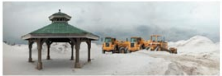
2004 Hurricane Ivan

Hurricane Ivan - Pensacola Beach Sand moving and sifting was a major project for a year following both Hurricane Ivan in 2004 and Hurricane Dennis in 2005.