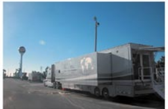
above: 2005 Hurricane Rita - Beaumont, TX