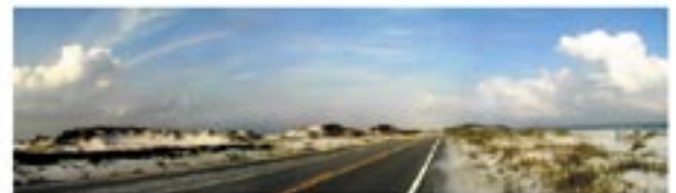
2002 Pensacola Beach, FL