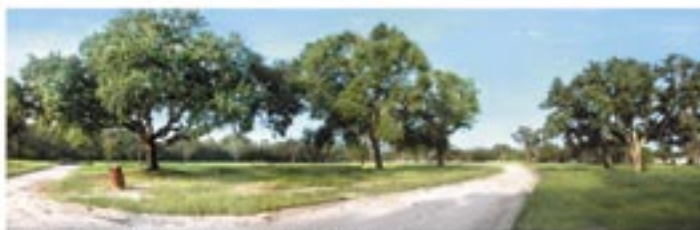
2005 Lexington Disposal Site Restoration