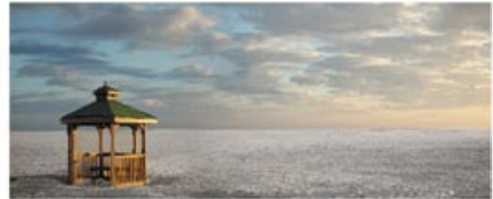
2005 Beach Reconstruction