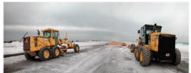
2005 Hurricane Ivan Reconstruction