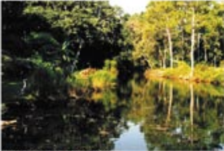
2003 Grande Lagoon