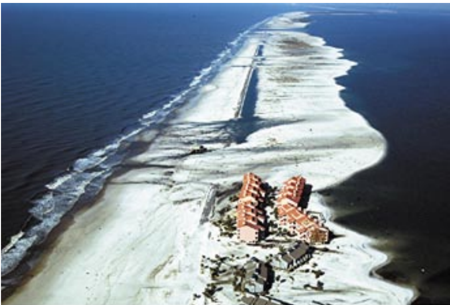
2004 Hurricane Ivan - Pensacola Beach, FL

When the best way to document your subject is from the air, our skilled aerial photographers take to the sky from the vantage point of a helicopter or fixed wing aircraft.