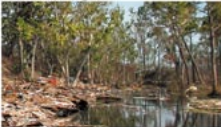
2005 Hurricane Ivan

On-site photography of disaster damage and future work sites provides reliable documentation of conditions before, during and after the event. The photo comparison on the left shows a deep water bayou adjacent to the Gulf of Mexico which was filled with the remains of homes and vehicles after Hurricane Ivan.