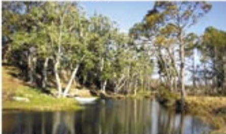
2006 Grand Lagoon Reconstruction